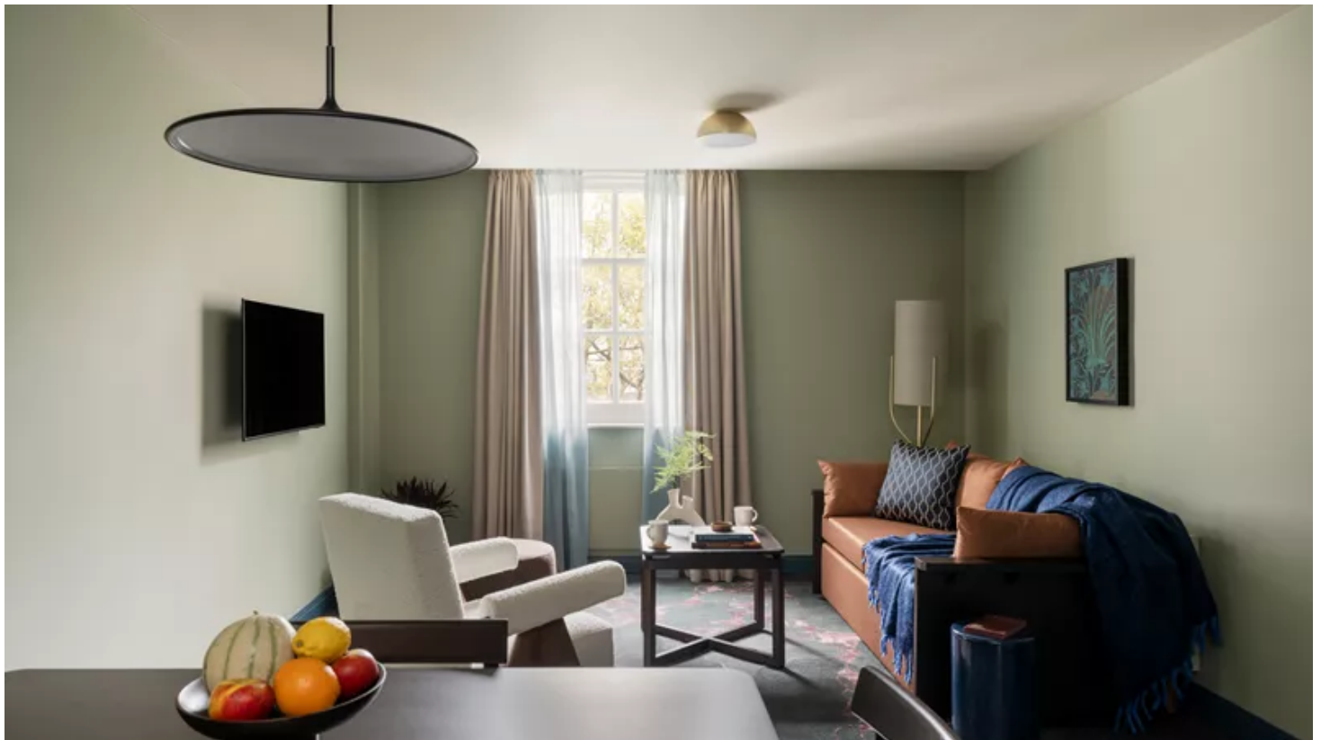
Example of Two Bedroom Apartment at Huntingdon House